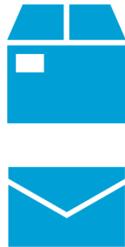
Total mail and parcel volumes